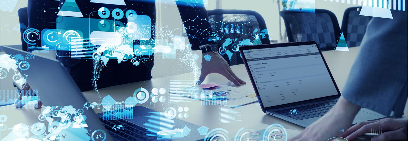
MeridianLink Consumer 'Deal Structure Overview,' within the application process.